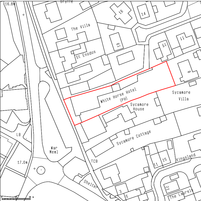
Site Location Plan Scale 1:1250

Licensable Activities May Take Place in All Public Areas Unless the Premises Licence Specifies Otherwise